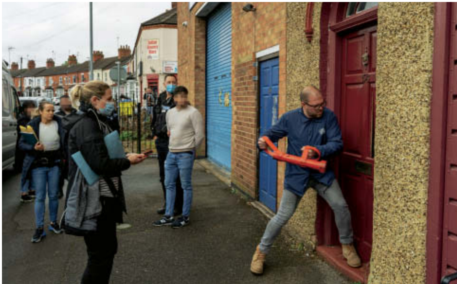
FROM TOP The modern slavery team forces entry into a house in the Midlands; a suspected victim of exploitation is apprehended after fleeing; police make a further arrest during the Midlands raid